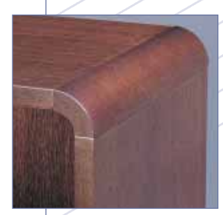
Radius edge detail for your contemporary office.